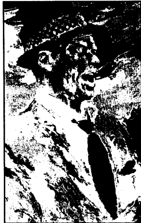
Ol' Blue Eyes Is Back: The album chart is 35 years old this week, and the top five are the oldest they have been in the history of the chart. While Take That have an average age of 21, Meat Loaf is 45, Diana Ross is 49, Bette Midler is 47 and Frank Sinatra is 77. Frank's Duets album debuts at number five, and is his 51st to make the listings, though it's the first of new material since the Quincy Jones produced L.A. Is My Lady in 1964. Frank is the oldest artist ever to chart an album of new material, replacing John Lee Hooker, and it's perhaps fitting he should establish the new record on the chart's birthday, since way back in 1958 he was number two in the very first chart with Come Fly With Me .

As well as forming part of the Euro-push on the chart, it's one of three singles reissued last week to immediately gain the Top 40 slot they initially missed out on. The others: Juliet Roberts' Free Love, which debuts at number 25 a year and a half after it peaked at number 83, and the Time Frequency's Real Love, which debuts at number 11, having reached number 60 some 17 months ago. All are remixed and the Time Frequency record is the