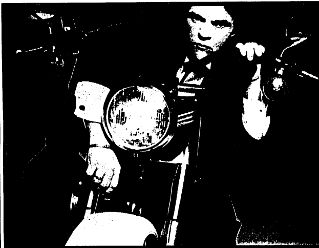
Double triumph: Meat Loaf captured the public's imagination