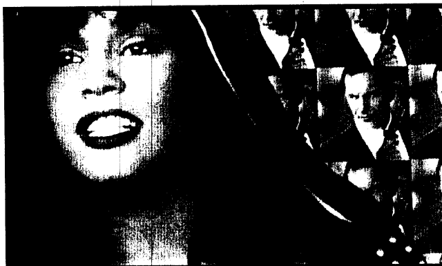
The Bodyguard , breaking the Now monopoly

Despite this setback, the Now series remains a huge force, accounting for five of the top 15 places, selling over two million