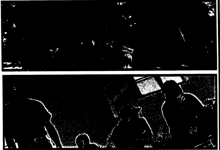
Runners up: UB40 (top) led the singles reggae revival while REM was Meat Loaf's album challenger