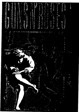
GNR: double-play VFM

The reasons for this may seem fairly obvious. Four of these eight albums were two-disc sets — Bryan Adams' Making Up The Neighbours , Primal Scream's Gemadefica and the two