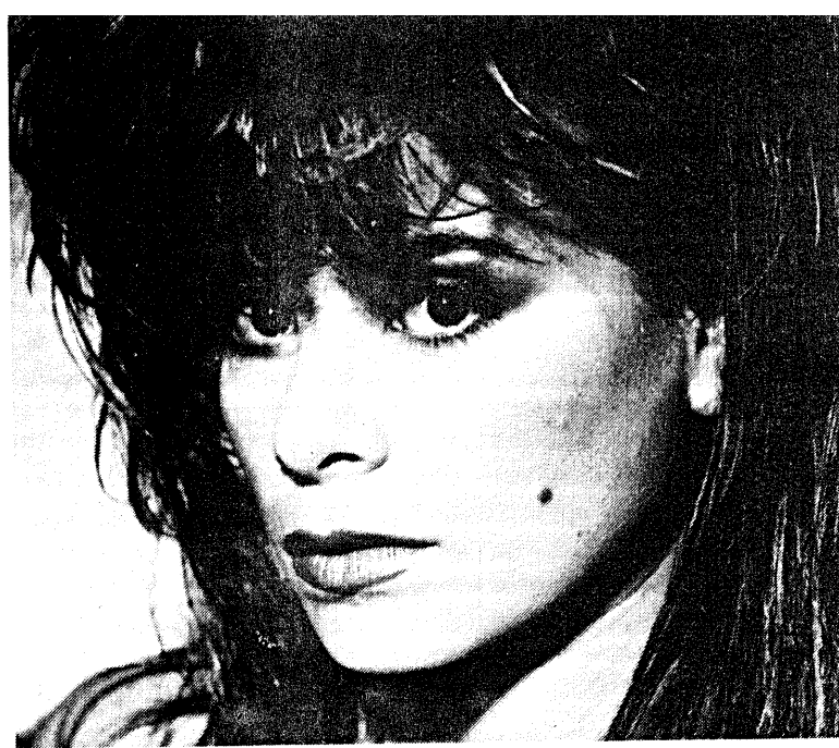
● PAULA ABDUL: "One word about the spot on my cheek and you're dead"