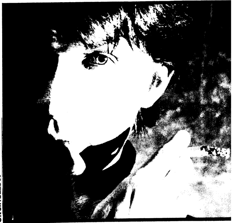
UK SINGLES 28

☆ Platinum (one million sales) □ Gold (500,000 sales) ○ Silver (250,000 sales)