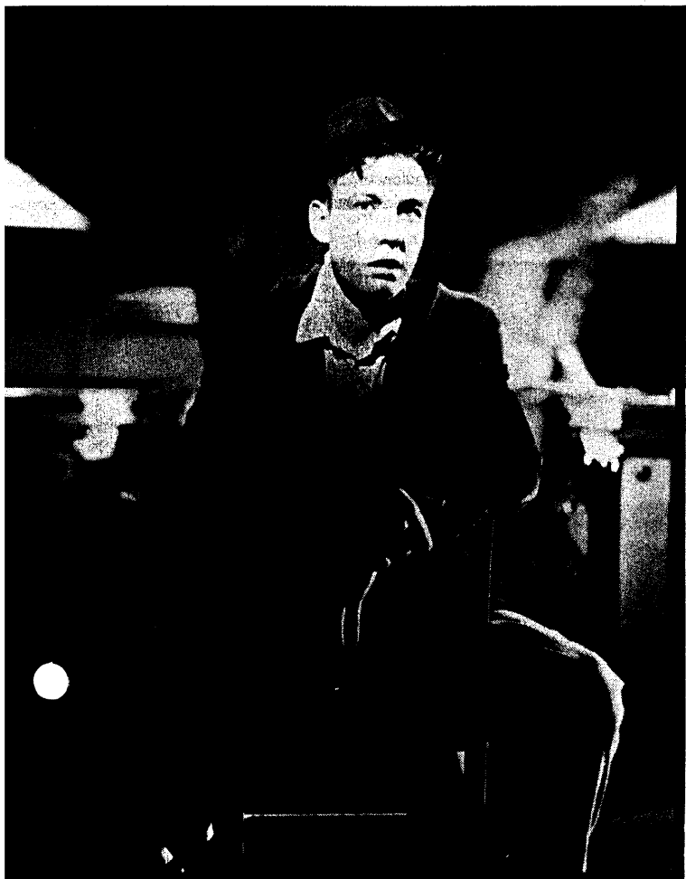
UK ALBUMS 94