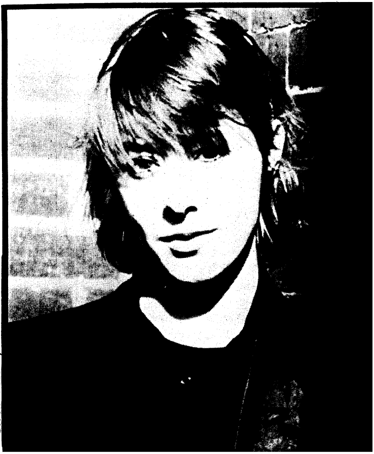
UK SINGLES 27, UK ALBUMS 38