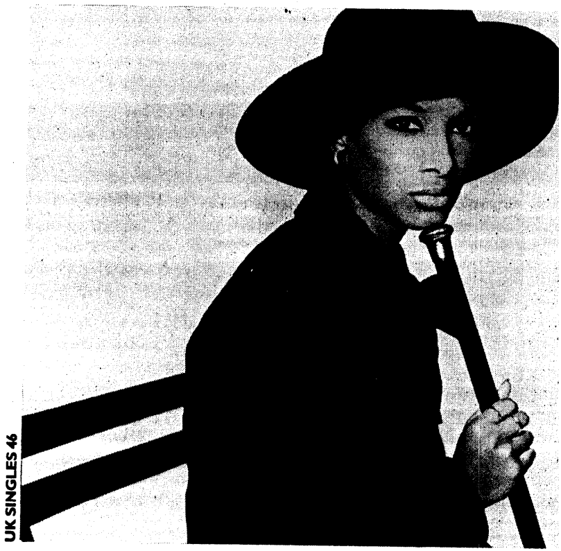
UK SINGLES 46