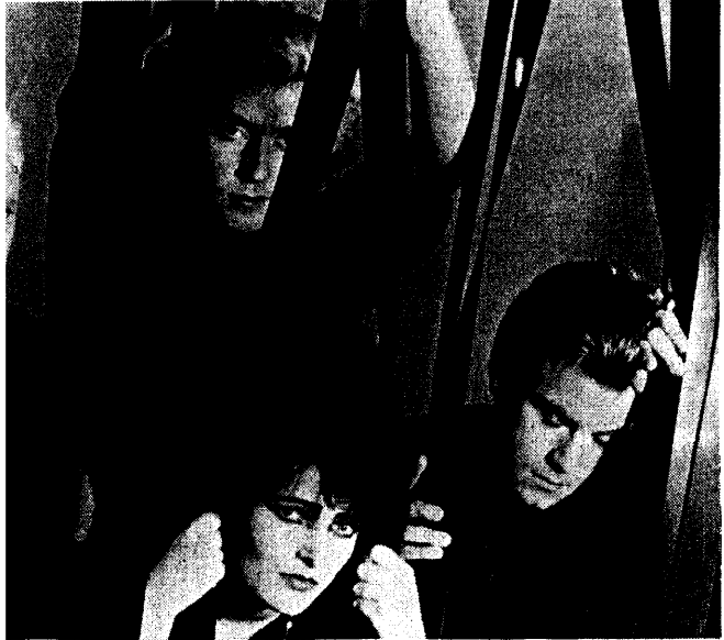
UK SINGLES 23