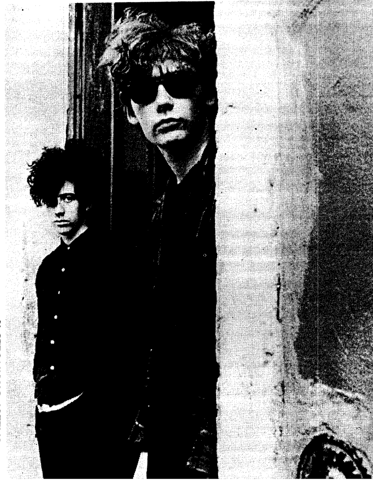
GALLUP UK SINGLES 46