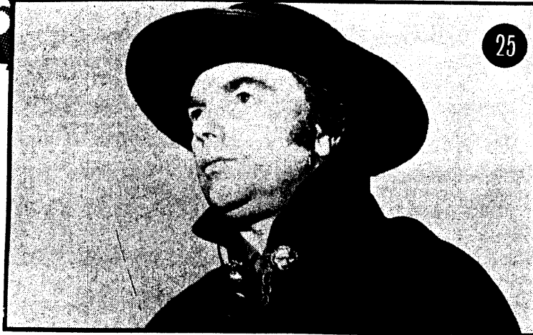
VAN MORRISON: the bright, young face of Highwayman chic