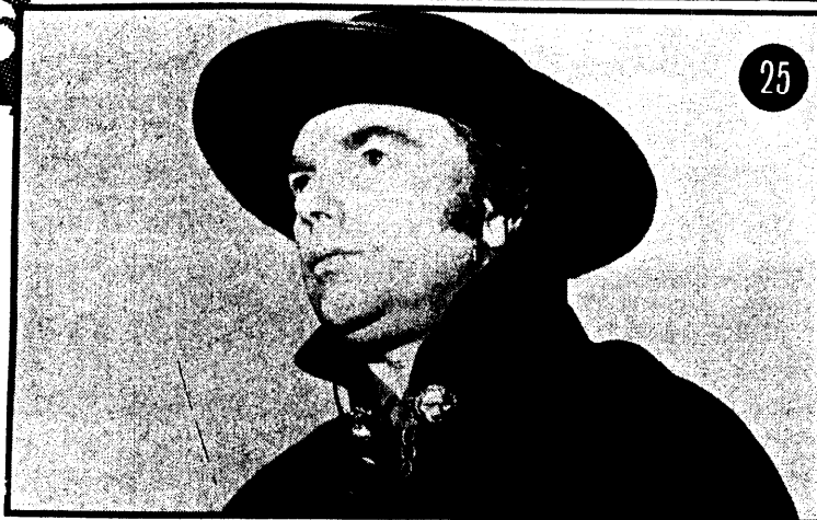
VAN MORRISON: the bright, young face of Highwayman chic