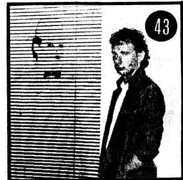
KILLING JOKE give the top 40 a much needed transfusion; HOWIE JONES gives it this week's most outré haircut; GAZ NUMAN & BILL SHARPE give us this week's most unlikely hit duo