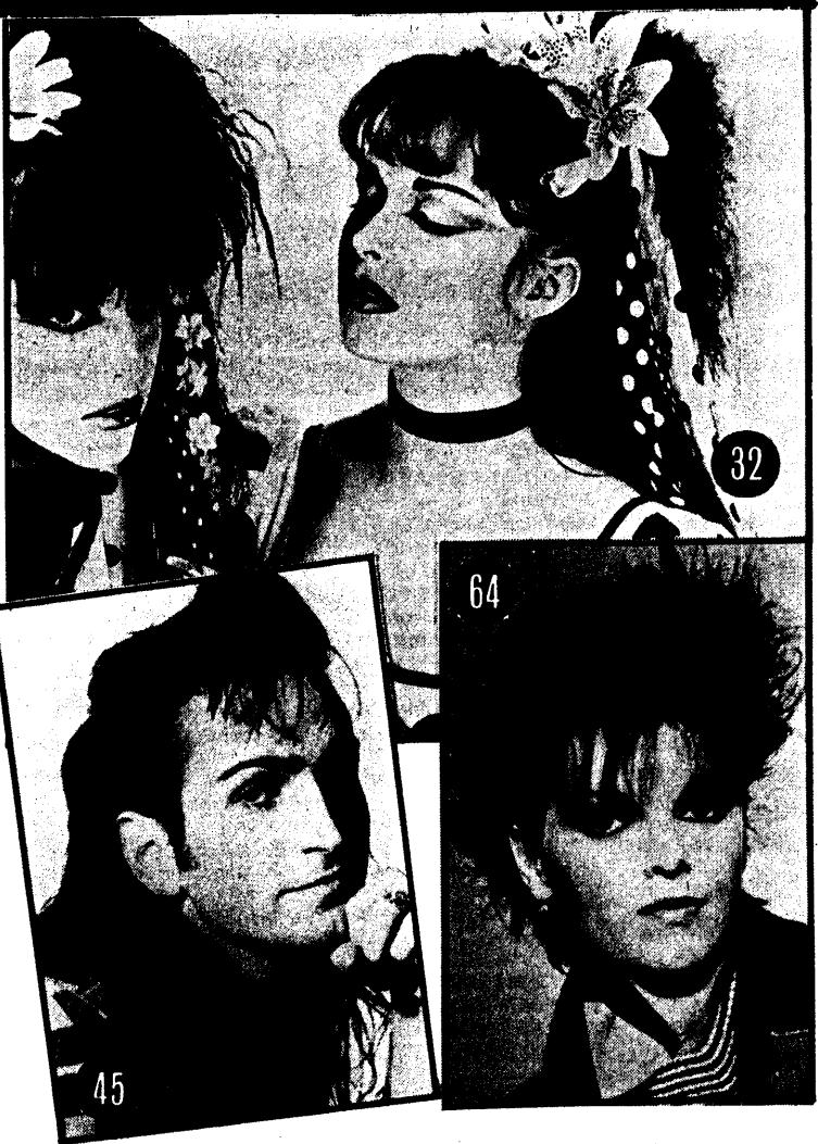
STRAWBERRY SWITCHBLADE: Juice about enough to get by; KING: Pride comes before a chart call; PAT BENATAR: A sense of belonging