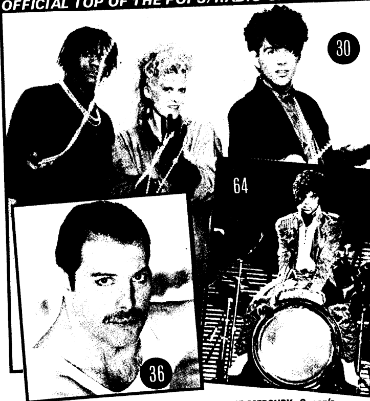
THOMPSON TWINS: another pearl of a hit; FREDDIE MERCURY: Queen's Christmas message?; PRINCE: feeling a little light on his feet?