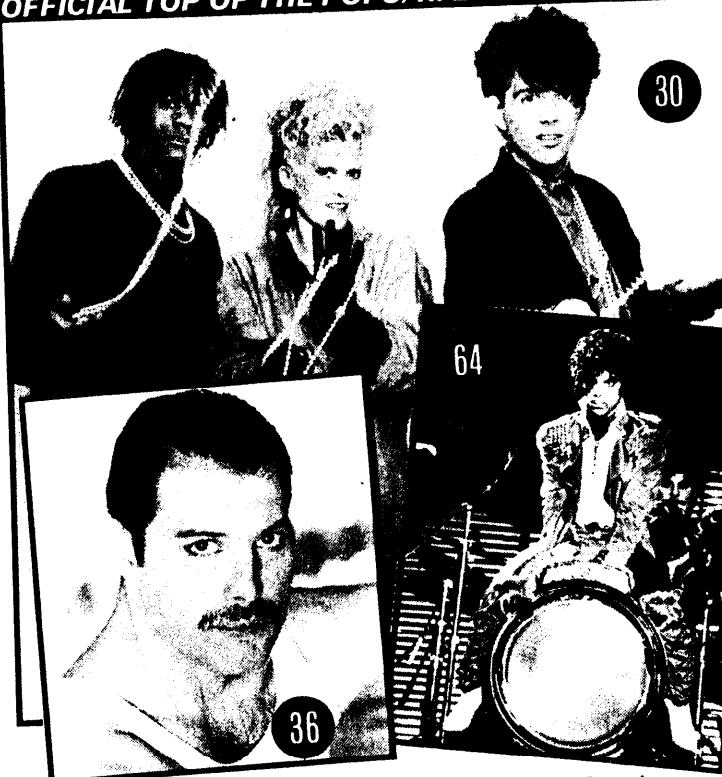
THOMPSON TWINS: another pearl of a hit; FREDDIE MERCURY: Queen's Christmas message?; PRINCE: feeling a little light on his feet?