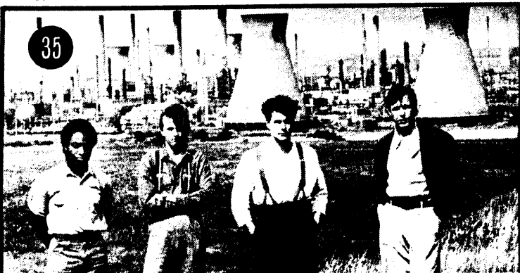
▲ BIG COUNTRY: handy hints for the garden

☆ Platinum (one million sales) □ Gold (500,000 sales) ○ Silver (250,000 sales)