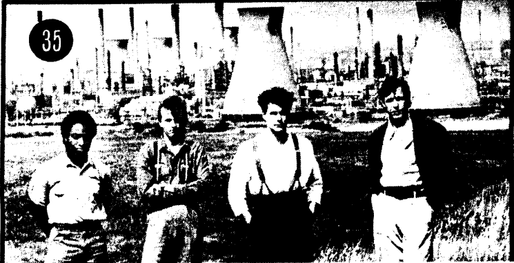
▲ BIG COUNTRY: handy hints for the garden

☆ Platinum (one million sales) □ Gold (500,000 sales) ○ Silver (250,000 sales)