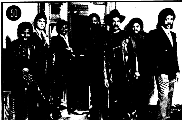
▶ THE DAZZ BAND about to clean up

☆ Platinum (one million sales) □ Gold (500,000 sales) ○ Silver (250,000 sales)