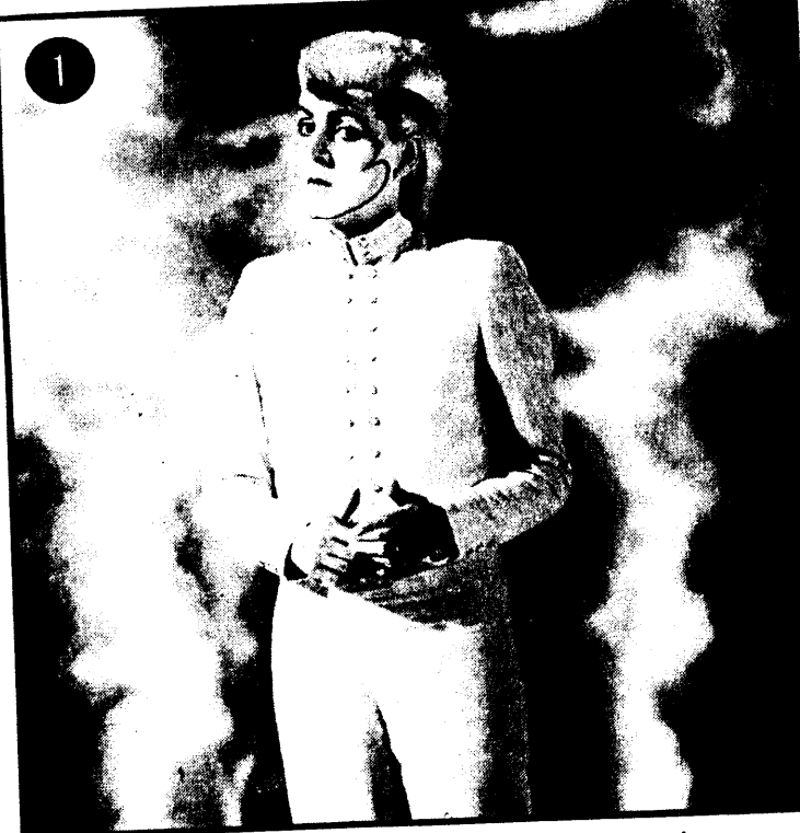
PAUL MCCARTNEY dressed to thrill; Boy George eat your heart out!