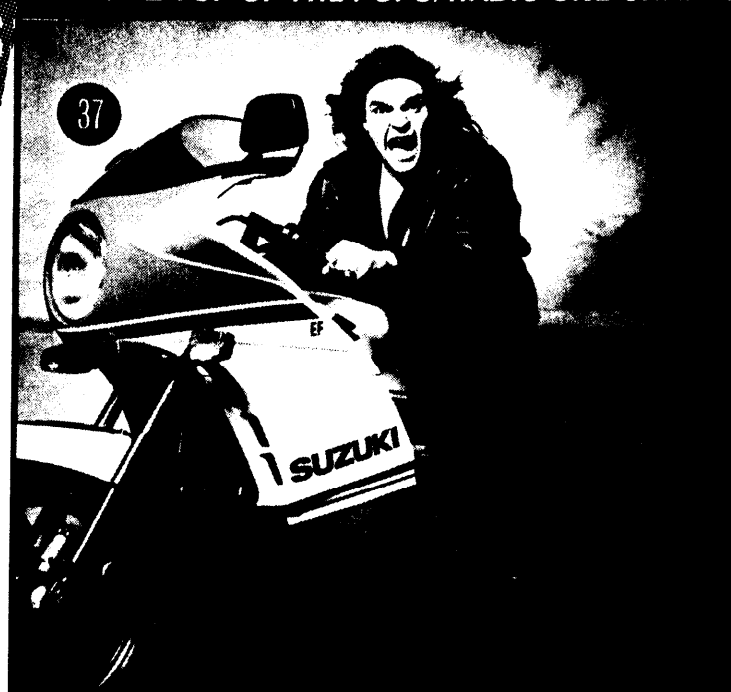
MEAT LOAF: 300 weeks and the 'Bat' man's still Robin someone of a chart slot