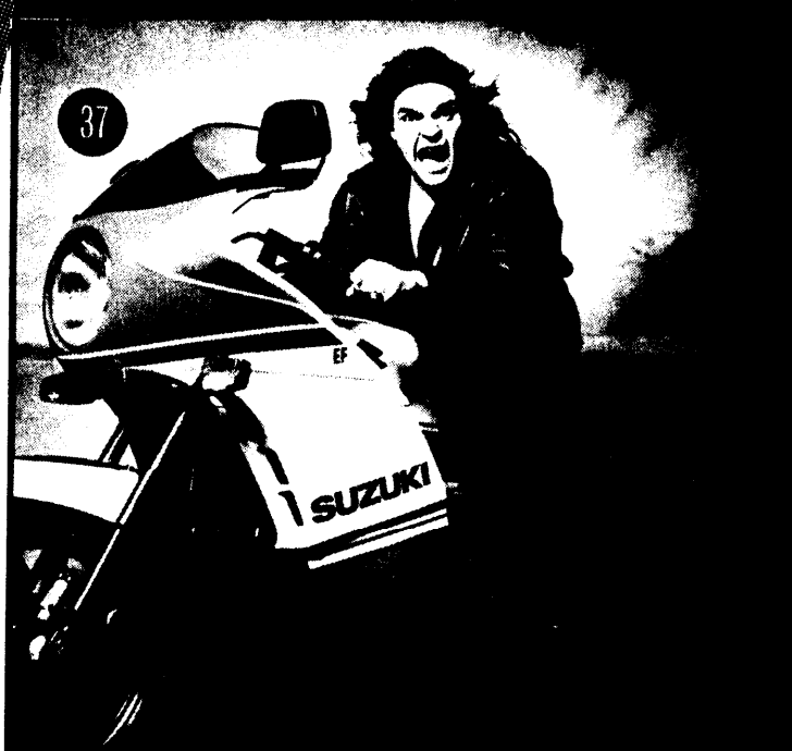
MEAT LOAF: 300 weeks and the 'Bat' man's still Robin someone of a chart slot