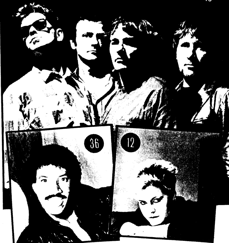
THE STRANGLERS: pores for thought; LIONEL RICHIE: get a cheap lover — you know it makes cents; ALISON MOYET: in need of some dry humour?