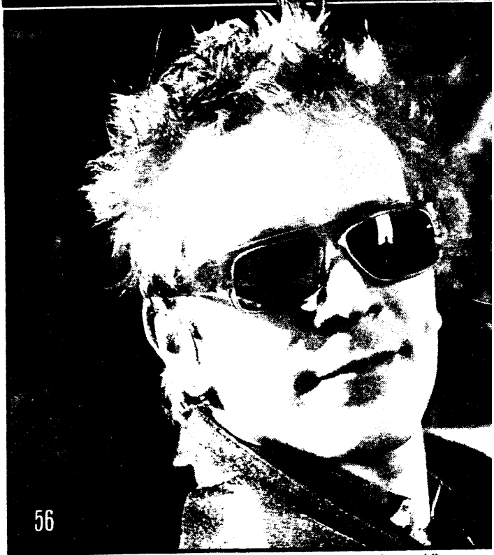
PIL: Rotten time for a public appear:

OFFICIAL TOP OF THE POPS/RADIO ONE CHART