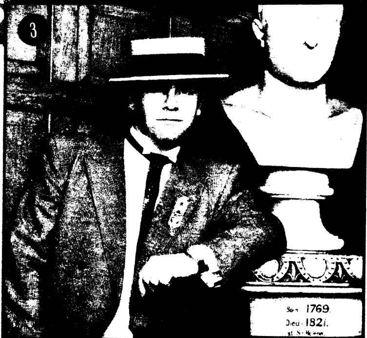
ELTON JOHN: "I've got a bigger bust than Joan Collins but less knockers!"