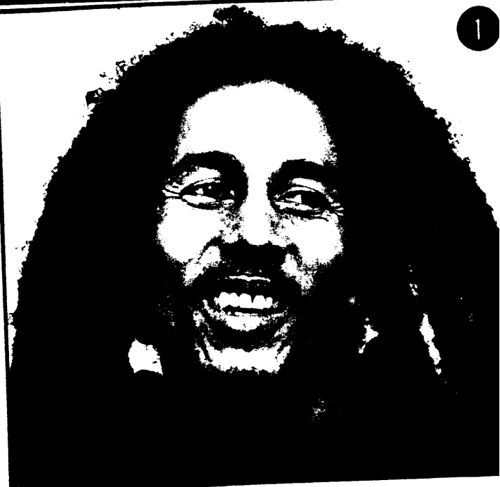
BOB MARLEY: A legend that will endure