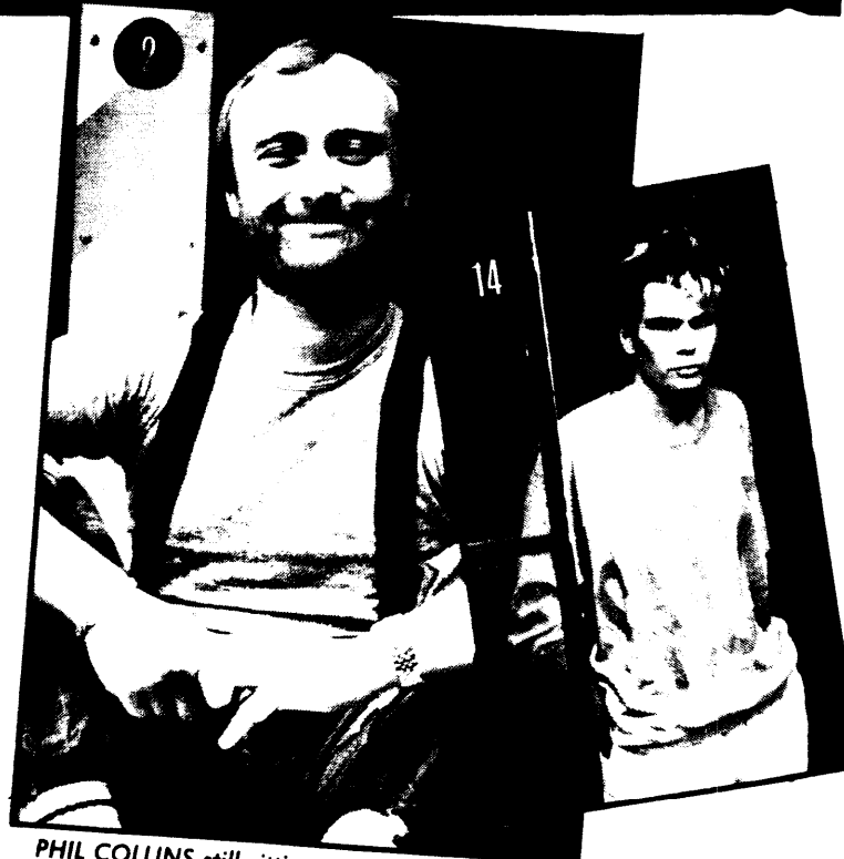
PHIL COLLINS still sitting pretty; NIK KERSHAW: big things come in small packages