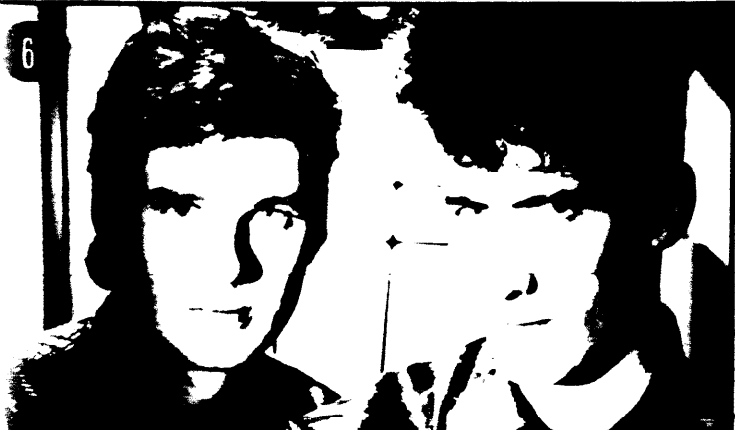
◀ OMD have engineered another hit

Platinum (one million sales) Gold (500,000 sales) Silver (250,000 sales)