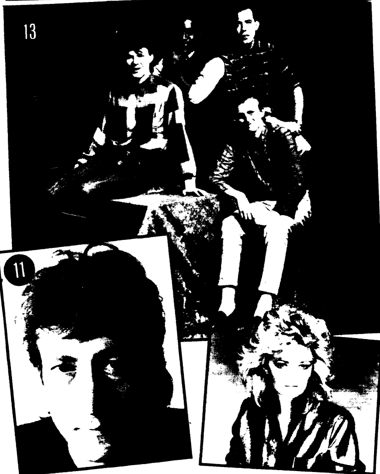
BIG COUNTRY: yet more table cloth chic; JOHN LENNON: a promising newcomer, could make a few bob; BONNIE TYLER: continuing her Save The Wales campaign