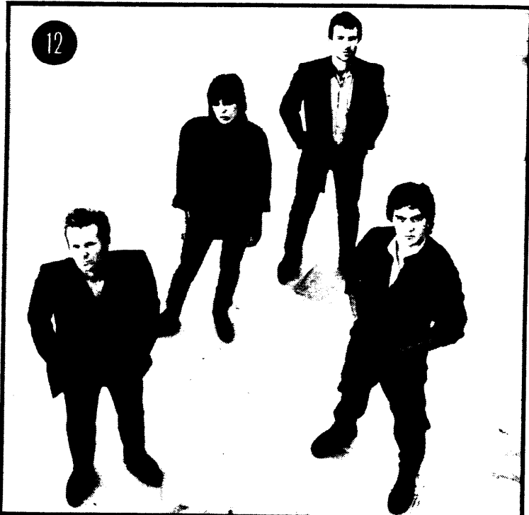
THE PRETENDERS attempt 'Stranglers Pose No 42'