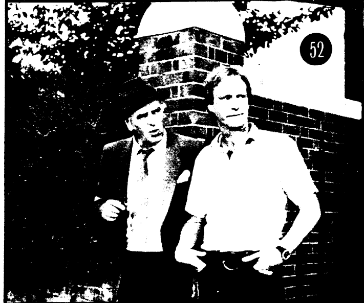
ARTHUR AND TERRY: men wrestling with one of the eternal dilemmas; BILLY JOEL: proof that smoking stunts your growth; ELTON JOHN: did you see him on telly without that hat? (chortle, belch, gales of drunken laughter etc etc).