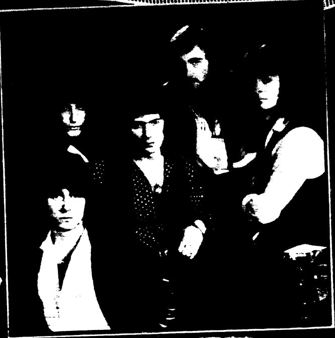
RAINBOW: Shape up at 11