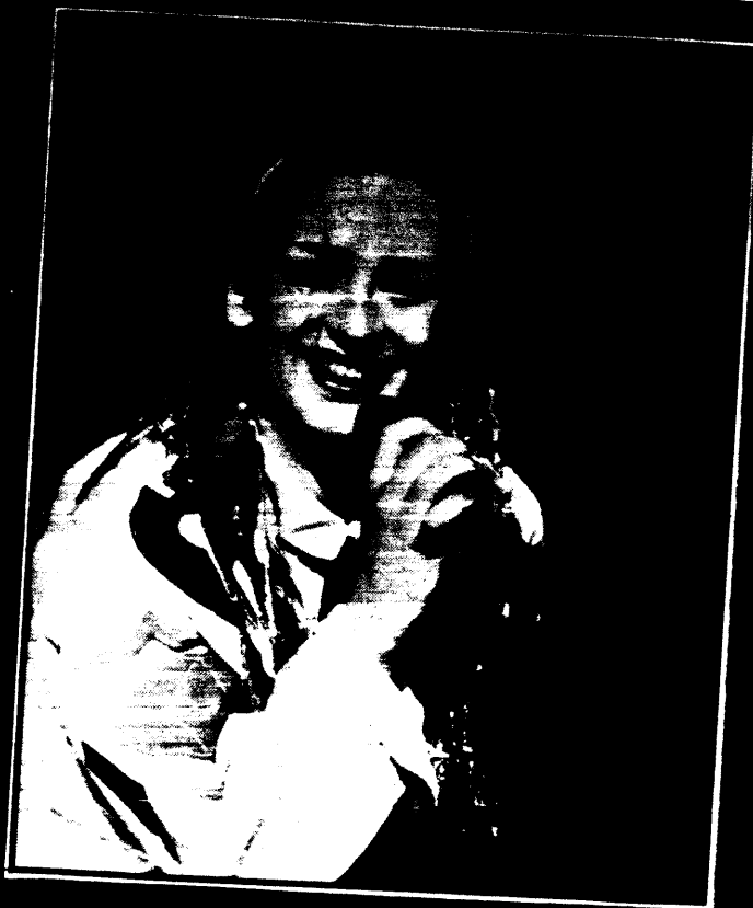
BOY GEORGE: Instant Karma at 3