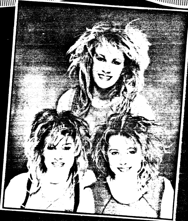
BANANARAMA: Summer starts at 36