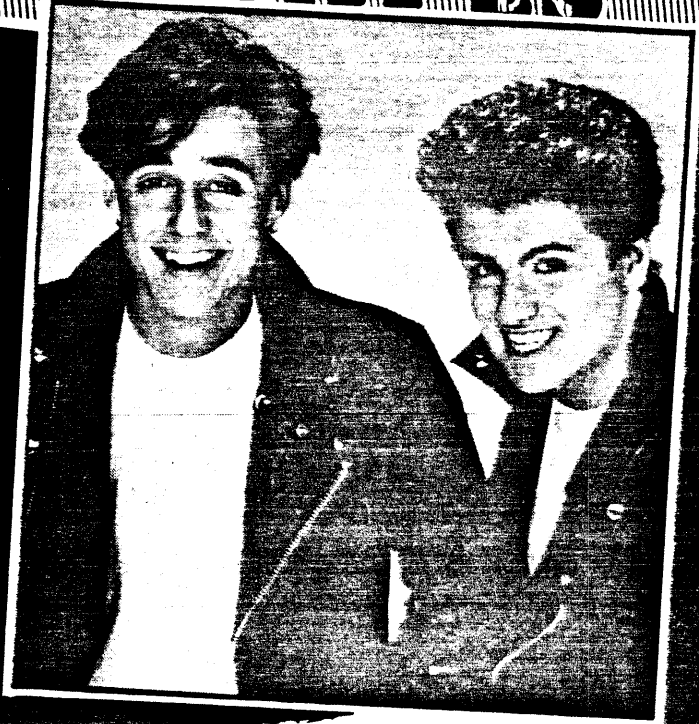
WHAM!: 1 for the boys