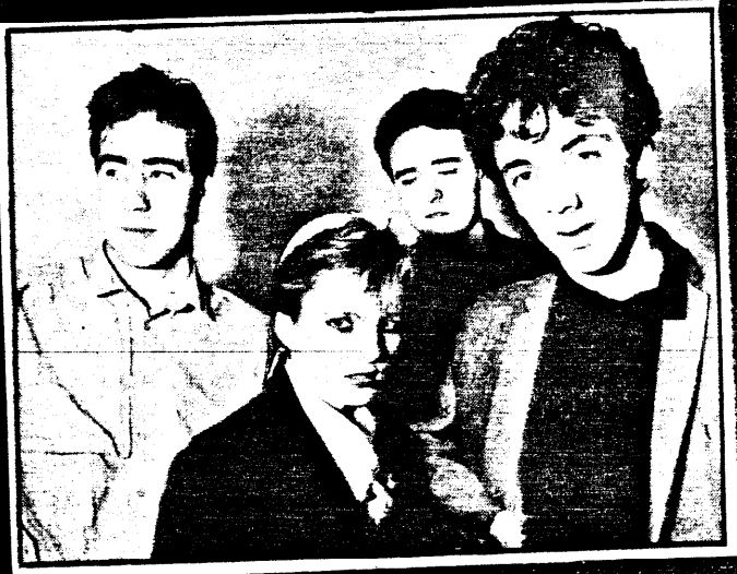
ALTERED IMAGES: a nip for the top at 18