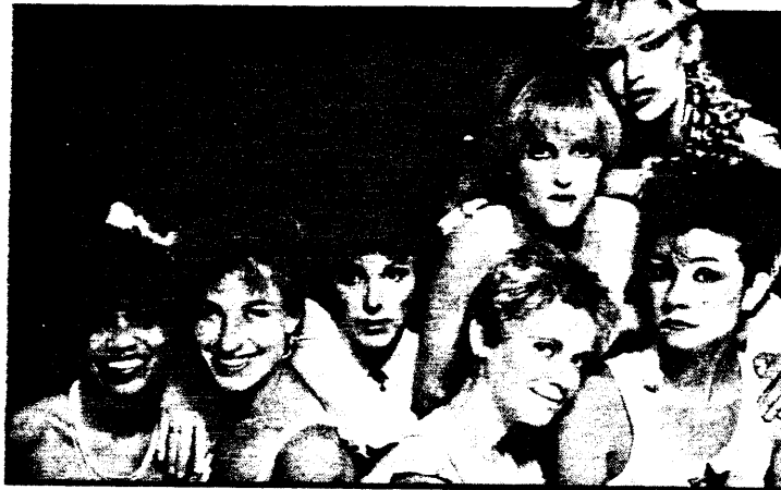
BELLE STARS: all their own work

A belated and short-lived British chart entry for Taco Ockers with his RCA twin-pack 'Puttin' On The Ritz'/'Singin' In The Rain.' The 27-year old, born in Indonesia of Dutch parents and now making his home in Hamburg, was one of Europe's top 10 acts last year. His popularity was mostly due to the runaway success of 'Puttin' On The Ritz' which, incredibly, could become the first of more than 500 versions of