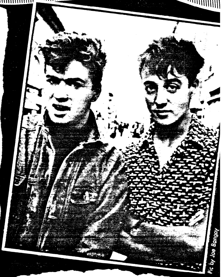
WHAM: in at 37