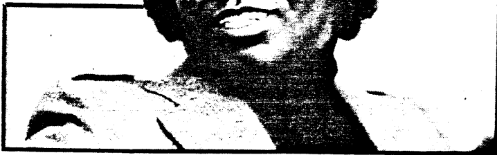
JAMES BROWN: coming up for his 150th (hit, that is)

B Y ONE of those fascinating strokes of fate, a fake Prince and a real Dame are linked together by their chart exploits.