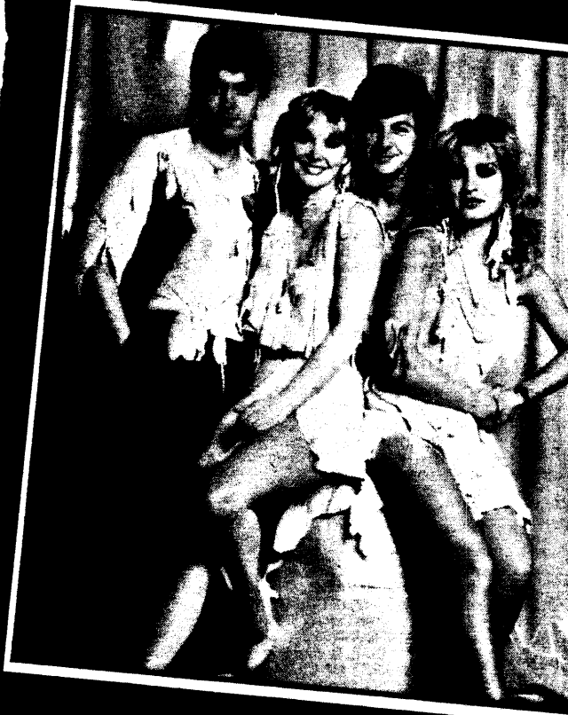
BUCKS FIZZ: running all the way to 21