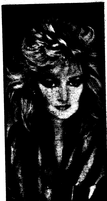
BONNIE TYLER: a great debut scandal

The 27-year-old singer's achievement is made even more impressive when you take into account that Tyler is not a number one performer. Shirley Bassey (1959) and Tina Turner (1983) Tyler's only other number one hits. Tyler's success is a result of some of the most powerful marketing forces in the music industry. Tyler's record company, RCA, is one of the most powerful and successful in the world. Tyler's record company, RCA, is one of the most powerful and successful in the world. Tyler's record company, RCA, is one of the most powerful and successful in the world.