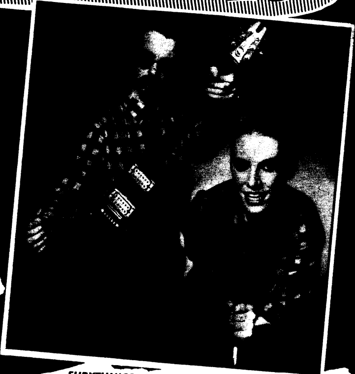
EURYTHMICS: dreams come true at 5