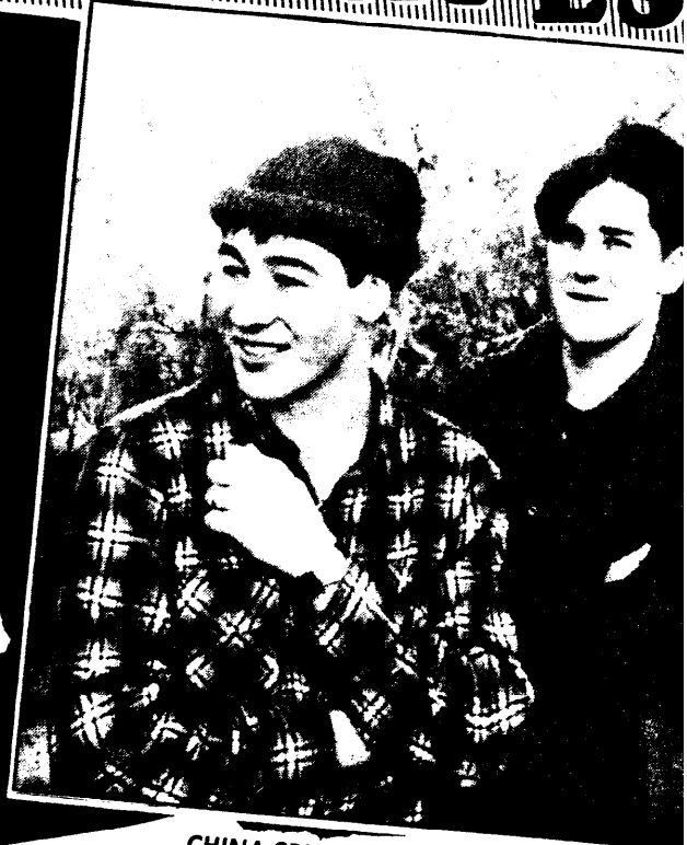
CHINA CRISIS: shapes of things at 28