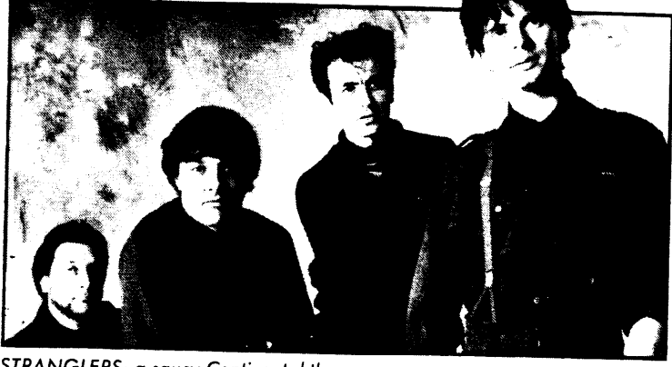
STRANGLERS: a saucy Continental theme

I N THE first 29 years of British singles charts only one of the 8,000 records to hit the charts included Africa in its title; that being Johnny Dankworth's 1951 pop tenner 'African Waltz'. But the last few months have seen two records mentioning the dark continent making the chart. First was China Crisis' excellent 'African And White' and now, leading the chart in harness, is Toto's 'Africa' and Jukka's catterings 'Of Africa'. As previously reported, Jukka's offering is Britain's first African pop disc. Toto's single has only been released in that format in America and next week the shops here in a similar, but very limited, edition. Continuing the continental theme, the recent singles chart includes the Anglers' 'European Female' whilst the album chart includes 'Aria' by the group same name. Bubbling under the charts are 'Africa', and top of the charts are from At Work with 'Downer', an obvious reference to Australia's largest single constituent of the continent of Oceania. The chart also includes four singles with 'world' in their titles: Dionne Warwick's 'All The Love In The World' and the second, third and fourth hits by The Jam, namely 'All Over The World', 'The Modern World' and 'News Of The World'. Returning to Toto, the multi-talented African group have reached the high point of their career to date. 'Africa' is