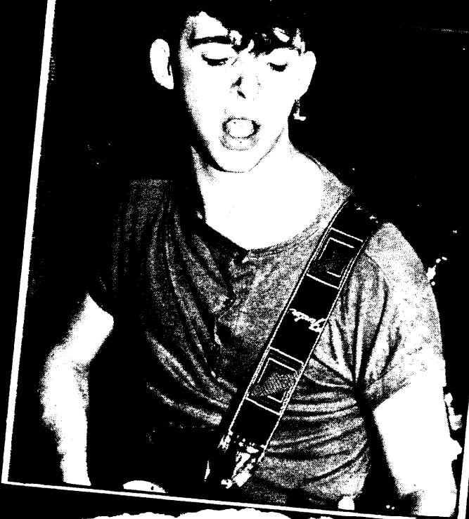
TEARS FOR FEARS: changing places at 5