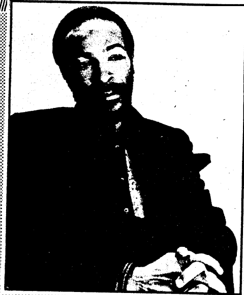
MARVIN GAYE: Feeling his way to 5