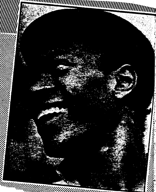
THE BEAT: barbed treasure at twenty one.