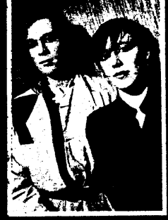
HUMAN LEAGUE: It's a double, folks!