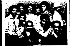
Getting UP on It, Kool & The Gang.