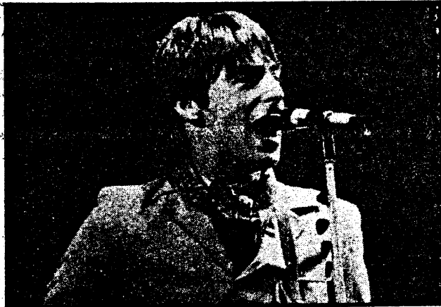
JAM: 'Town Called Malice' straight in at number one.

SIOUXSIE & THE BANSHEES, Spectrum ADAM & THE ANTS, Home Video Productions ROCK FLASHBACK, Deep Purple, BBC/3M THE BEST OF BLONDIE, Chrysalis QUEEN GREATEST FLIX, EMI IVIA NEWTON-JOHN, Physical, EMI FLOYD, Live At Pompeii, Spectrum LIZZY, Live & Dangerous, VCL JACKSONS IN CONCERT, VCL STARS, EMI ELVIS, King of Rock 'n' Roll, World of Video 2000