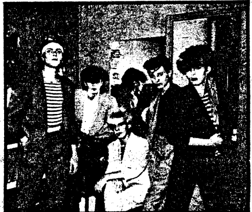
Duran Duran: number one in Portugal.

THE US singles chart is positively creaking at the moment as ageing stars make unexpected chart comebacks. Del Shannon started the ball rolling some ten weeks ago when his remake of the 1959 Phil Phillips (US) / Marty Wilde (UK) hit 'Sea Of Love' charted. With Tom Petty handling production, it climbed to No. 33, Del's biggest hit since 'Stranger In Town' briefly glimpsed the top thirty in 1965. It's Del's first hit of any description since 1966.