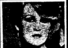
Susanna Sulley of the Human League